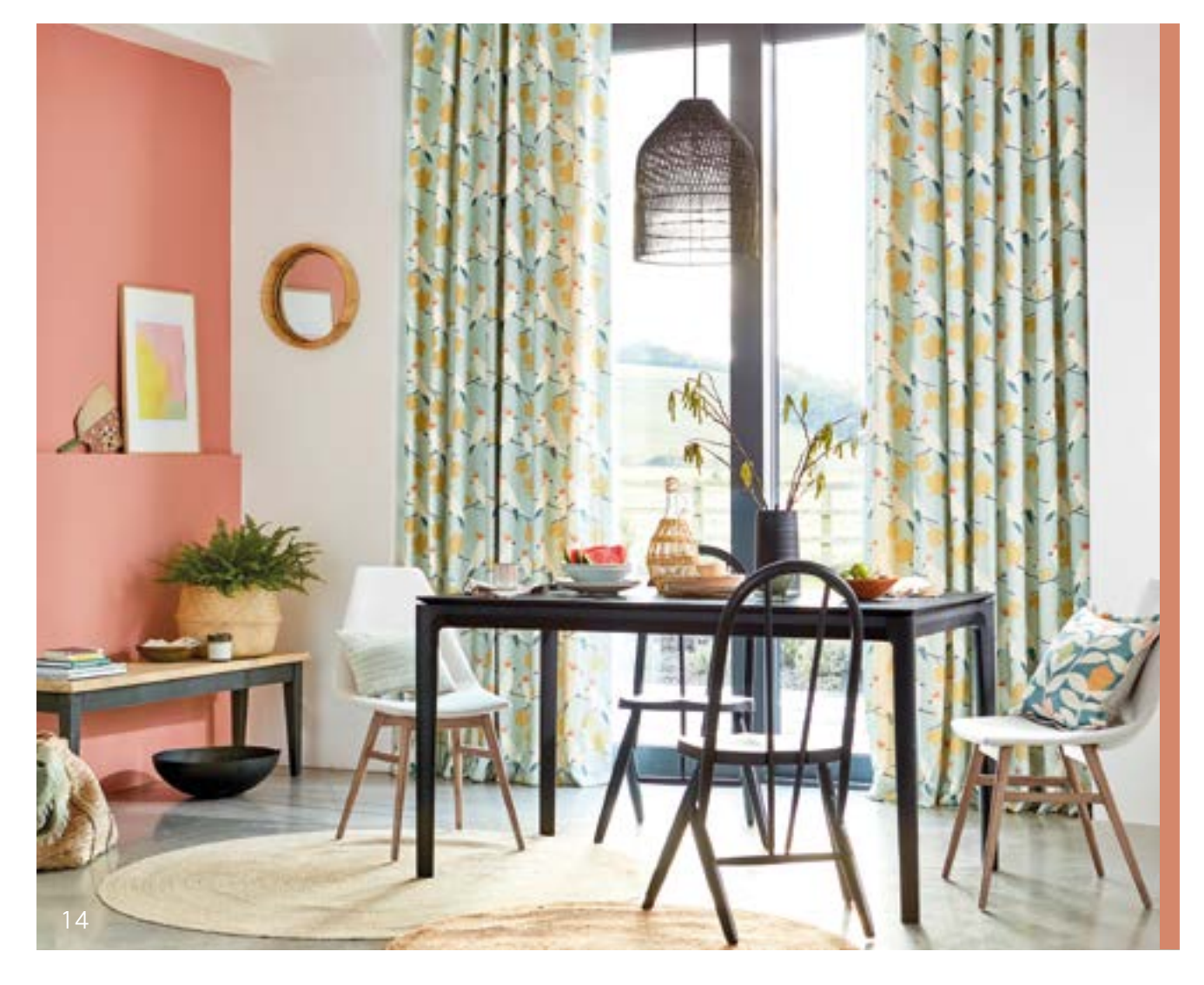
BRIGHT AND BEAUTIFUL...

All things bright and beautiful make a home a little less ordinary.