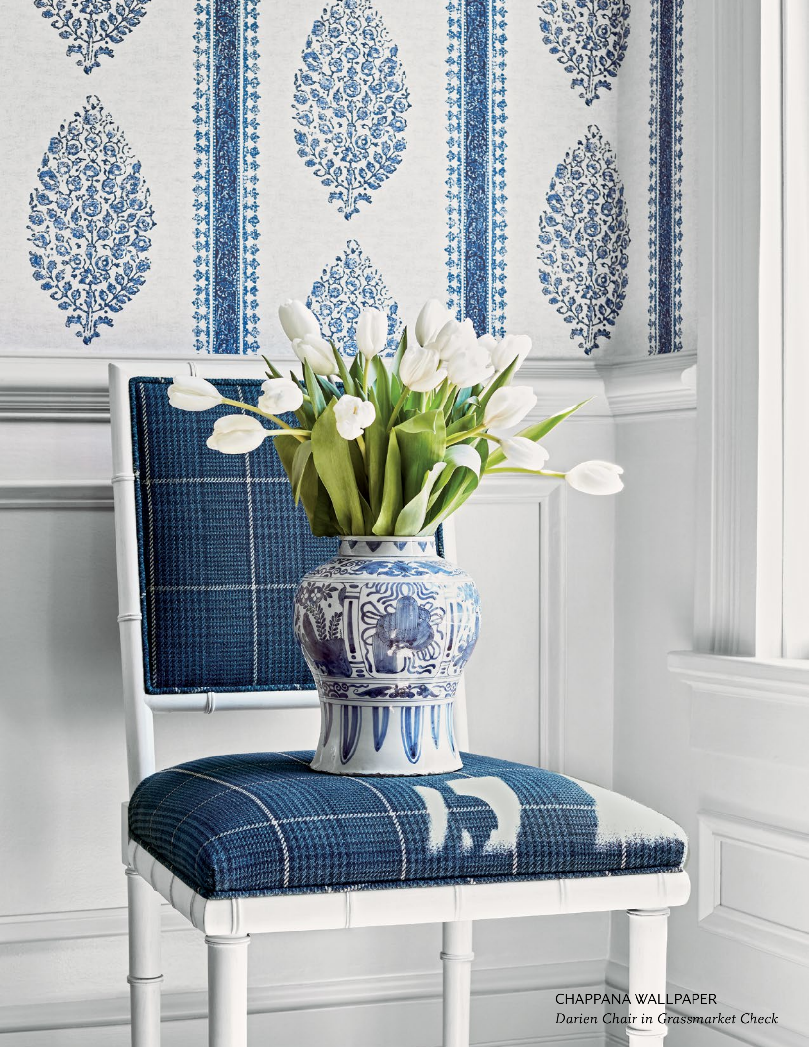
CHAPPANA WALLPAPER Darien Chair in Grassmarket Check