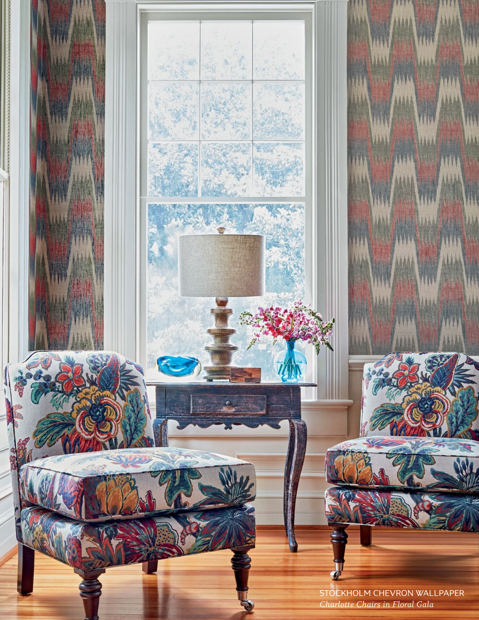
STOCKHOLM CHEVRON WALLPAPER Charlotte Chairs in Floral Gala