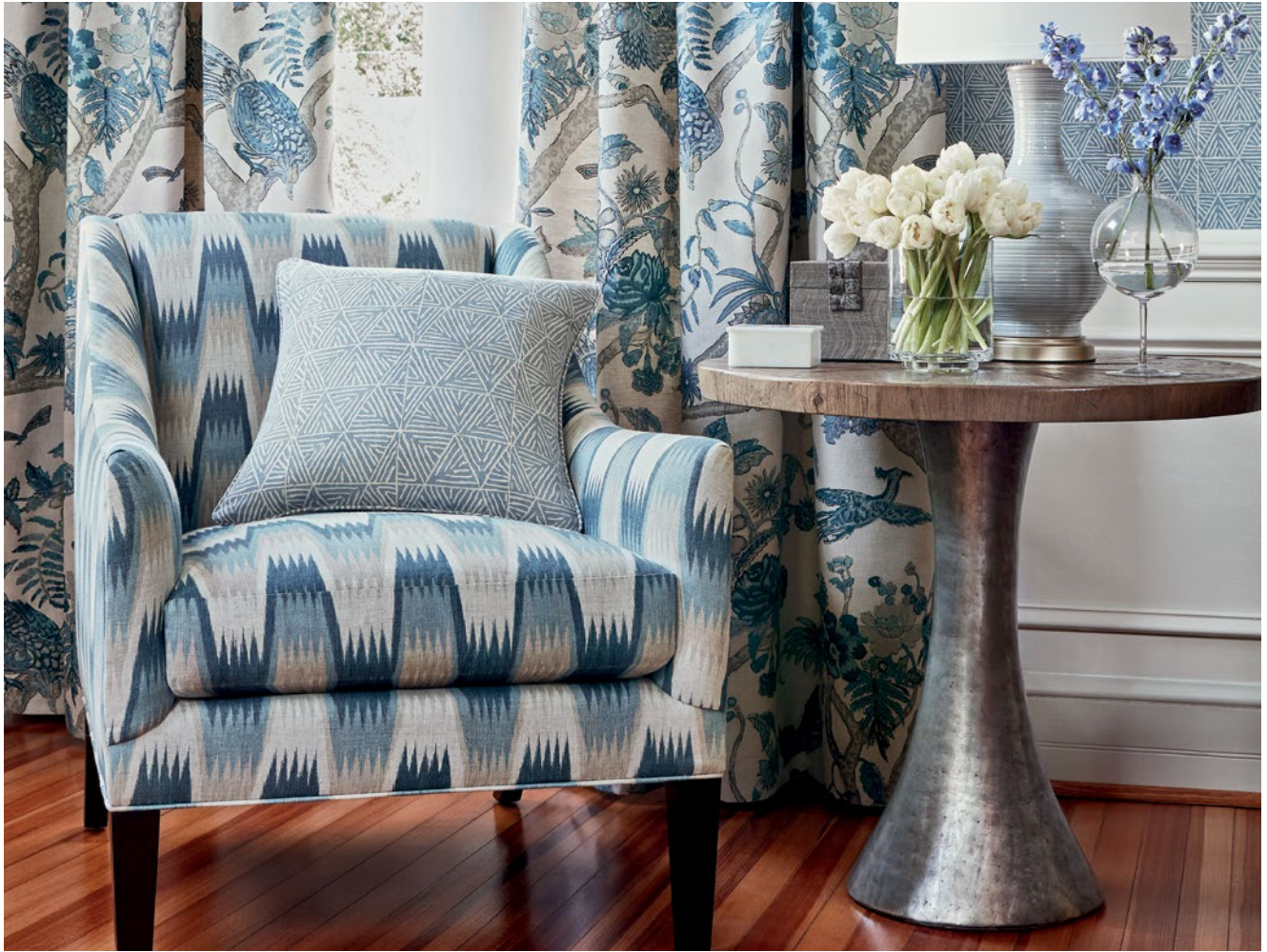
Mombasa Wallpaper & Fabric. Saybrook Chair in Stockholm Chevron. Draperies in Coromandel.

Colony is a curated collection of wallcoverings and fabrics influenced by centuries-old techniques of African craft and textiles that travelled the trade routes. Graphic mudcloth and chevron designs, loosely painted florals and a scenic tiger reserve landscape come together with a coordinating tailored plaid, bold giraffe print, and primitive shapes. This abundant collection is filled with colors ranging from natural earthy tones and greys to vibrant crimson reds, deep blues, verdant greens and saffron that were inspired by artisanal natural dyes.