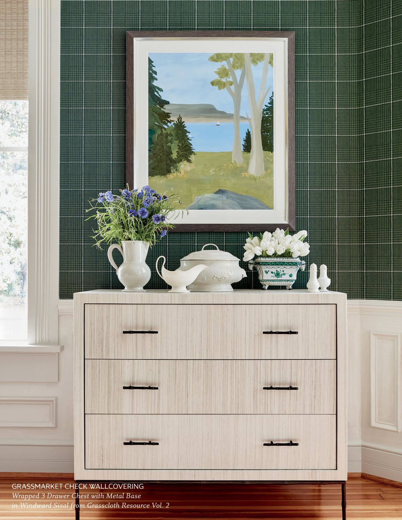
GRASSMARKET CHECK WALLCOVERING Wrapped 3 Drawer Chest with Metal Base in Windward Sisal from Grasscloth Resource Vol. 2