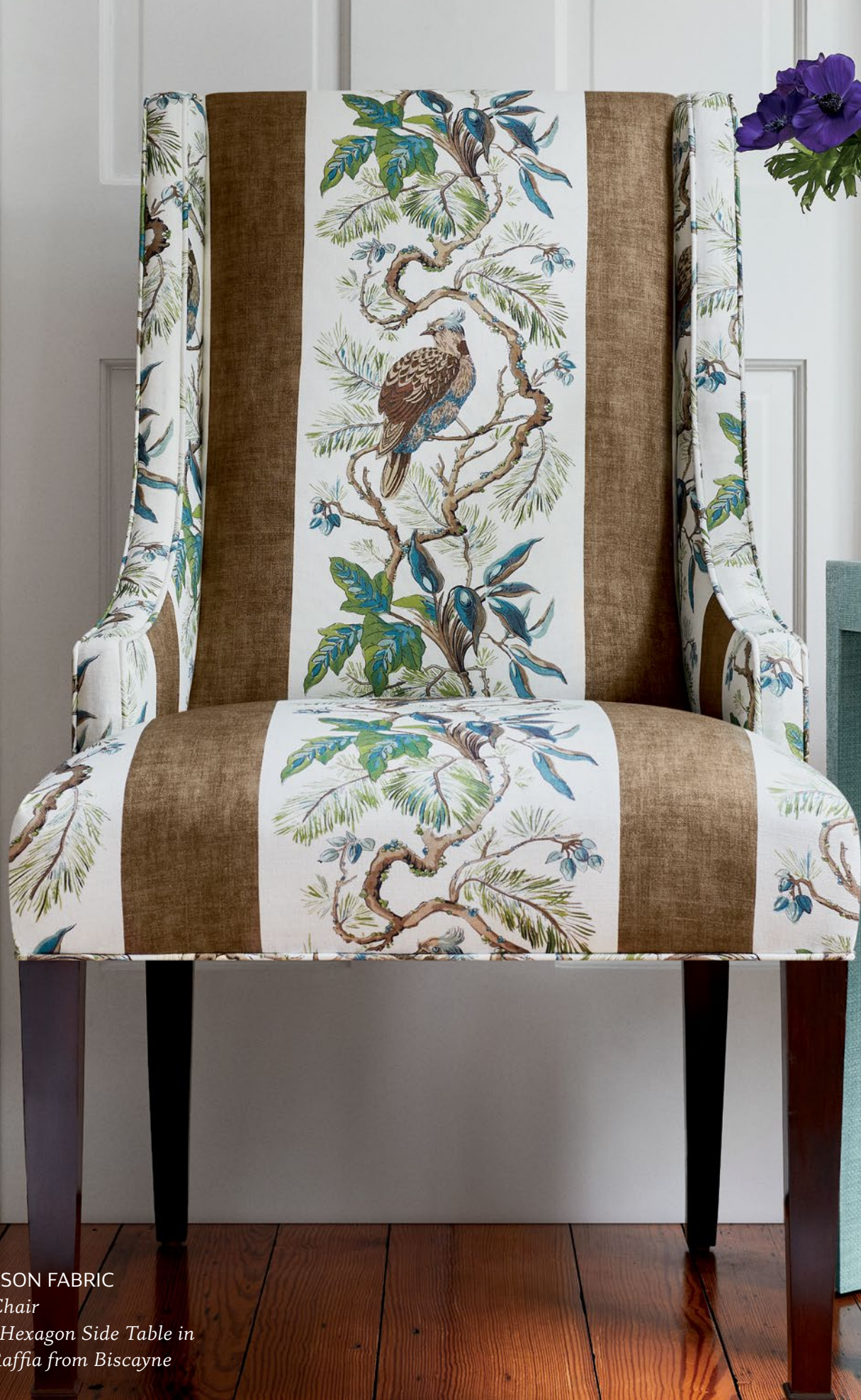
WILLIAMSON FABRIC Hudson Chair Wrapped Hexagon Side Table in Regatta Raffia from Biscayne