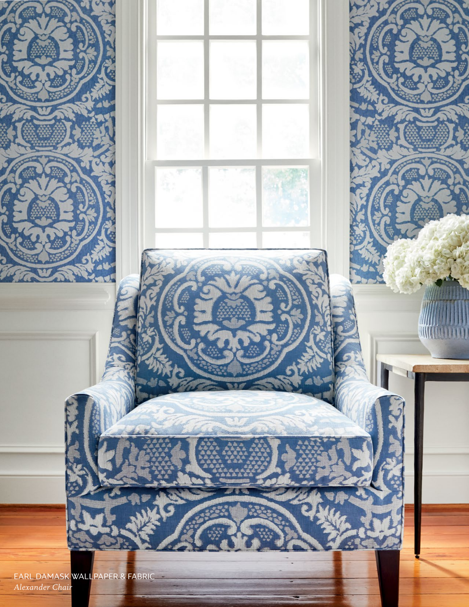
EARL DAMASK WALLPAPER & FABRIC Alexander Chair