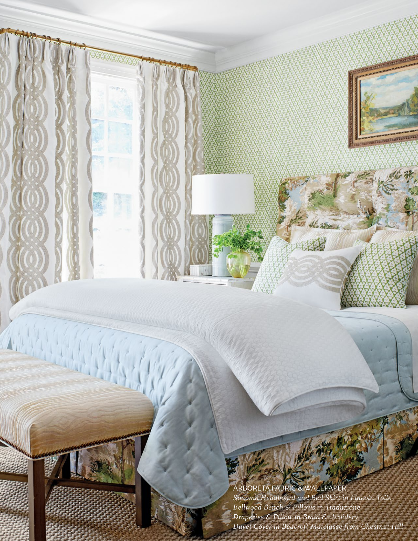
ARBORETA FABRIC & WALLPAPER Sonoma Headboard and Bed Skirt in Lincoln Toile Bellwood Bench & Pillows in Traduzione Draperies & Pillow in Braid Embroidery Duvet Cover in Beacroft Matelassé from Chestnut Hill