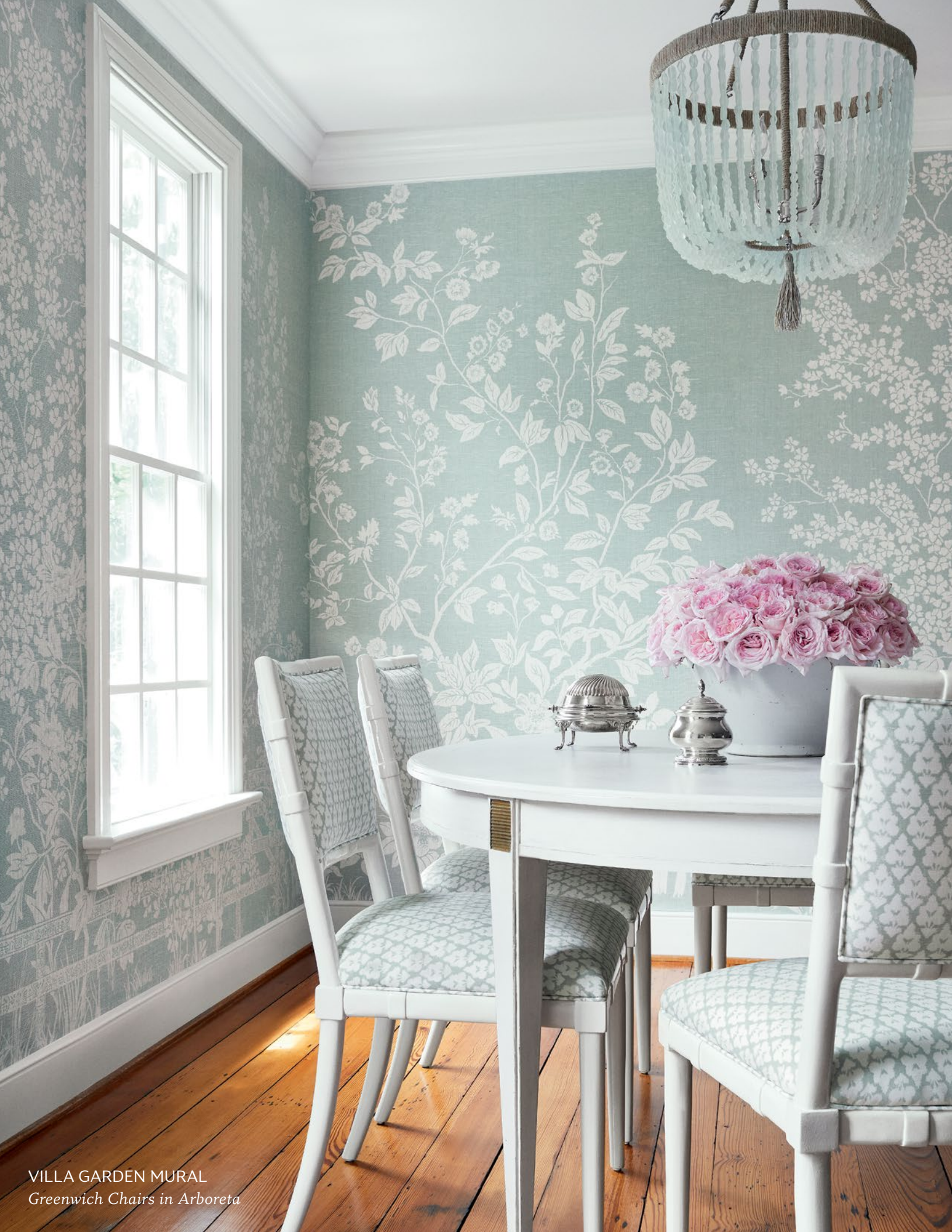
VILLA GARDEN MURAL Greenwich Chairs in Arboreta