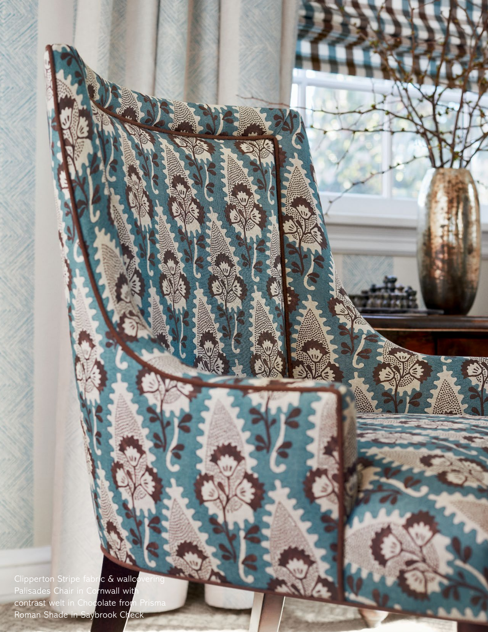
Clipperton Stripe fabric & wallcovering Palisades Chair in Cornwall with contrast welt in Chocolate from Prisma Roman Shade in Saybrook Check