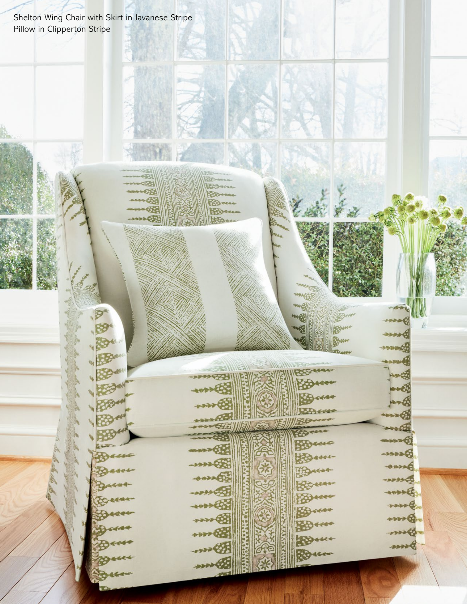
Shelton Wing Chair with Skirt in Javanese Stripe Pillow in Clipperton Stripe