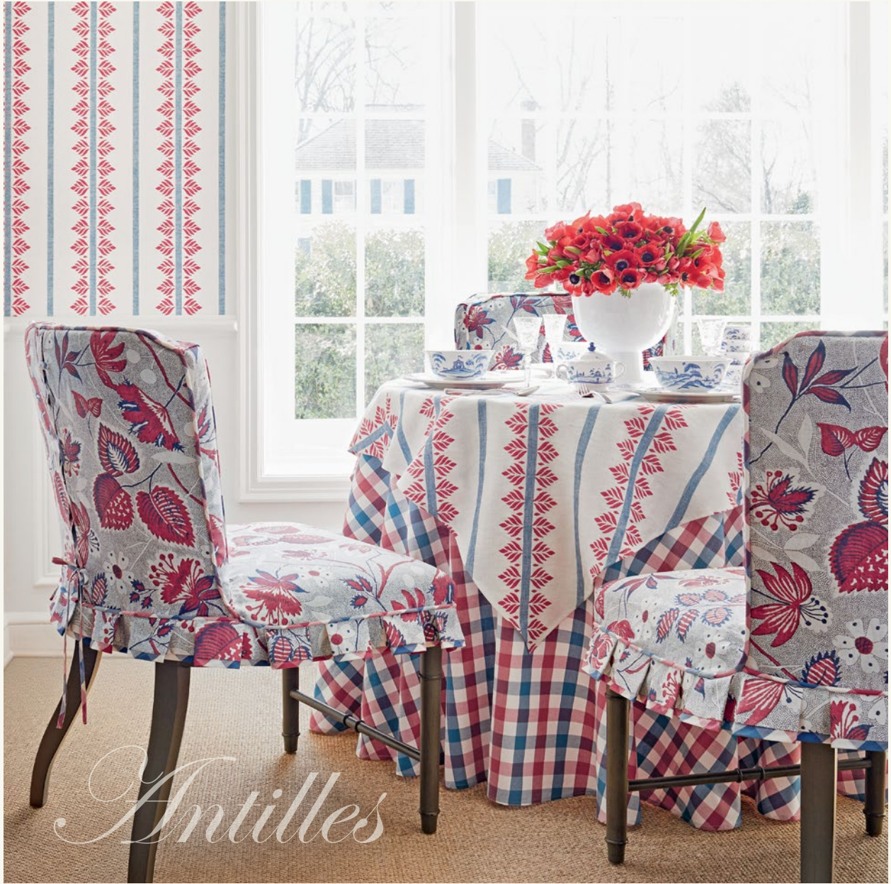
Fern Stripe wallcovering & fabric. Stirling Chairs in Indienne Hazel. Tablecloth & chair welting in Saybrook Check.

The Antilles collection encompasses a thoughtful balance between 18th century French Provincial designs and historical reproductions of exotic, brightly colored motifs from India known as Indiennes . These patterns of coordinating fabric and wallcoverings were influenced by the extensive history of the islands' legendary agricultural developments and the highly treasured legacy of the indigo crop. A mix of scenic elements and elegant details taken from antique documents round out this offering of timeless designs.