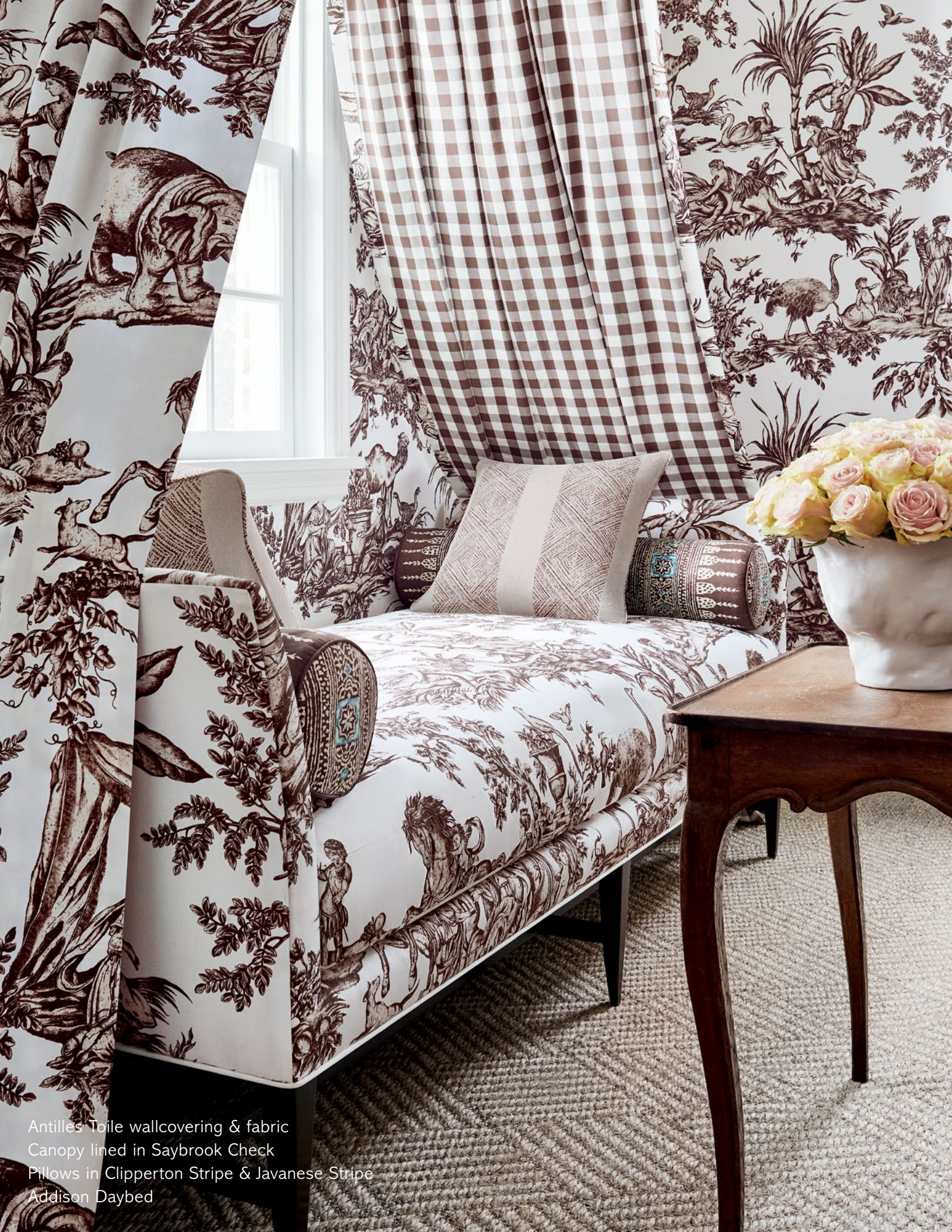
Antilles Toile wallcovering & fabric Canopy lined in Saybrook Check Pillows in Clipperton Stripe & Javanese Stripe Addison Daybed