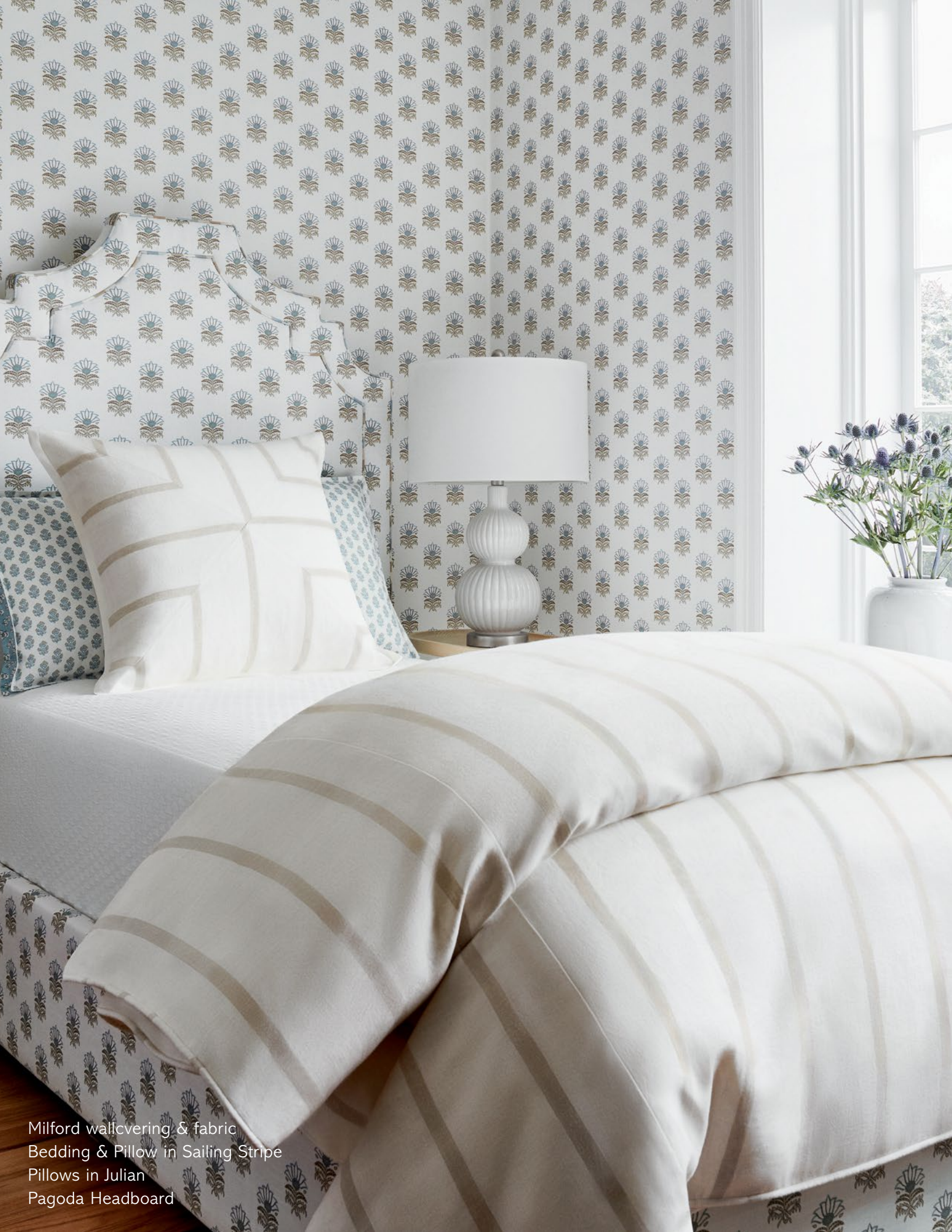
Milford wallcovering & fabric Bedding & Pillow in Sailing Stripe Pillows in Julian Pagoda Headboard