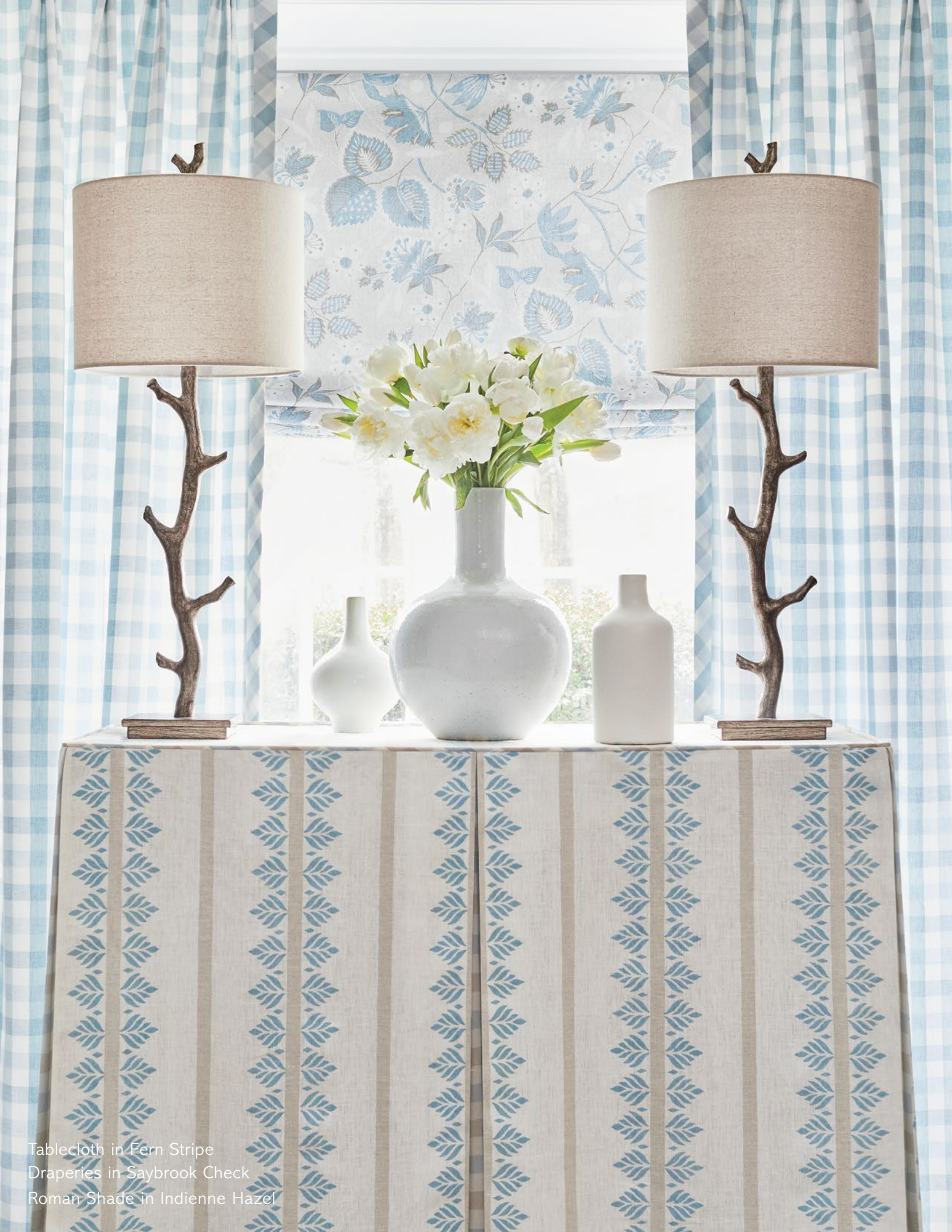
Tablecloth in Fern Stripe Draperies in Saybrook Check Roman Shade in Indienne Hazel