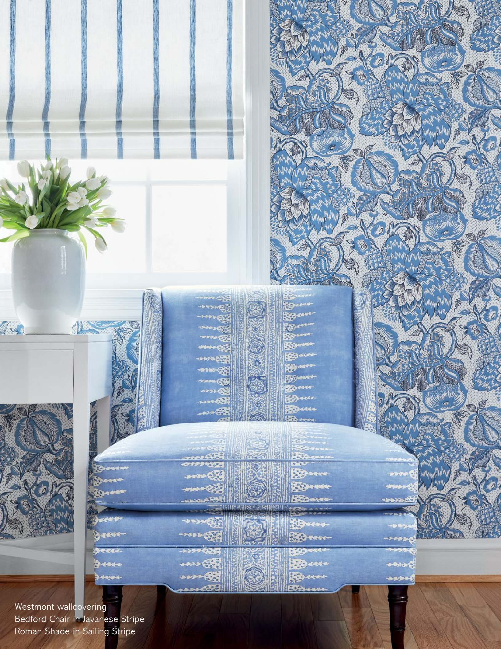
Westmont wallcovering Bedford Chair in Javanese Stripe Roman Shade in Sailing Stripe